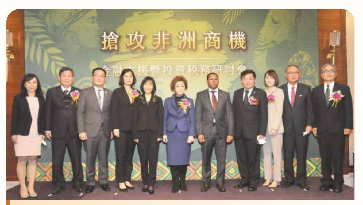
To assist companies in developing the Africa market, Eximbank and the Bureau of Foreign Trade hosted the seminar "Financing Support and Investment Taxation for the African Market". The purpose was to introduce Eximbank's policy-oriented services in financing and export insurance, assist companies in accessing capital and hedge risks with the government's financing support, and promote businesses' cooperation. (Photo taken in December 2020)

Eximbank's Anti-Money Laundering Center has established a compliance and enhanced management mechanism for Eximbank's anti-money laundering and counter terrorism financing (AML/CTF), and amended Eximbank's internal regulations related to AML/CTF in accordance with the latest amendments to the laws and regulations. Eximbank completed the ad-hoc audit of AML/CTF and Eximbank's "Comprehensive Money Laundering and Terrorism Financing Risk Assessment Report" (including Eximbank's AML/CTF plan) in accordance with the timeline set by competent authorities and submitted it to the Financial Supervisory Commission for future reference.