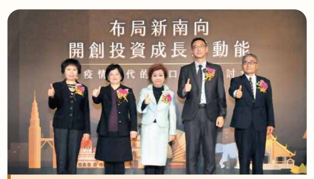
To support the New Southbound Policy, Eximbank organized the workshop "New Growth Momentum by Going Southbound – Export Strategy After COVID-19" to analyze taxation regulations of investment and risk management strategies to assist Taiwanese companies in developing the southbound markets. (Photo taken in December 2020)

At the end of December 2020, the United Kingdom and the European Union reached the EU-UK Trade and Cooperation Agreement, which has started a new page in the relationship between the United Kingdom and the European Union. As European countries continue to implement epidemic prevention restrictions in early 2021, we believe the European economy would still grow slowly in 2021.