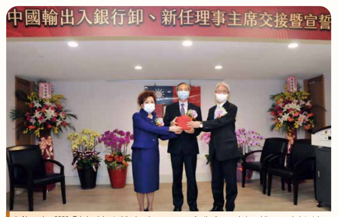
In November 2020, Eximbank hosted the handover ceremony for the former chair and the new chair to take an oath for office. The ceremony was under the auspice of Political Deputy Minister Juan Ching-hwa of the Ministry of Finance. (Photo taken November 2020)

Taiwan is a small open economy that is vulnerable to external shock and susceptible to international economy. With the benefit of the low base period of the severe recession in 2020, global output and demand are expected to rebound strongly in 2021. However, we still need to pay attention to the economic recovery momentum of important consumer markets, the development of the global epidemic, and the effectiveness of vaccines. In addition, financial vulnerabilities, such as geopolitical conflicts, trade wars, and continuously rising global debt, as well as climate change risks, are all uncertain factors that affect the economic outlook.