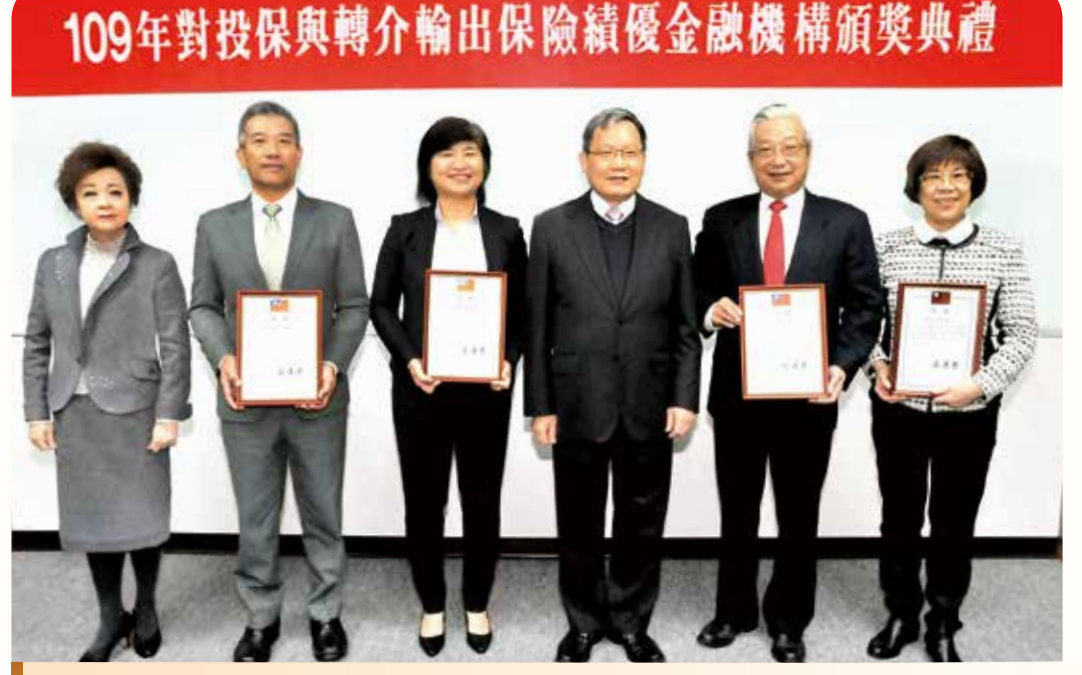
Minister Su Jain-rong of the Ministry of Finance issued the award at the Seminar for Government-Owned Financial Institutions in March 2021 to banks' outstanding performance in export credit insurance during 2020. This award demonstrates the government's emphasis on export credit insurance as a policy function. (Photo taken in March 2021)

Eximbank was approved by the Ministry of Finance to increase its capital by NT$19.711 billion from 2016 to 2020. After the increase of capital, the upper limit on the total credit balance for a single enterprise was raised to NT$5.223 billion, and the upper limit on the unsecured credit was raised to NT$1.741 billion, which could effectively increase Eximbank 's financing provided to enterprises and improve its ability to undertake larger financing cases. Through the capital increase, Eximbank has not only succeeded in reducing export enterprises' cost of funds and assisting them to avoid trading risks, but also driven