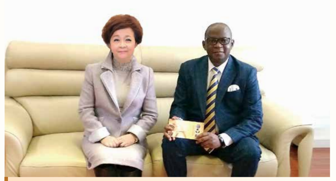
Chair Liu Pei-jean visited the Liaison Office of South Africa to accelerate Eximbank's footprint expansion in Africa and support Taiwanese companies penetrating the African market. (Photo taken in January 2021)

The asset applicable to "Impairment of Assets" in the IAS 36, when there is any indication that an asset may be impaired; Eximbank will evaluate the asset or its cash generating unit. An impairment loss is recognized when the recoverable amount (the higher of the fair value or of the value in use) is found to be less than the book value. On the end of reporting date, if the evaluation produces evidence indicating the recognized impairment loss of an asset in the prior year has no longer existed or has reduced, the recoverable amount should be re-measured. Reversal of impairment loss is recognized when the recoverable amount of the asset has increased. However, the book value after the reversal should not exceed the depreciated or amortized book value of the asset assuming no impairment loss was recognized.