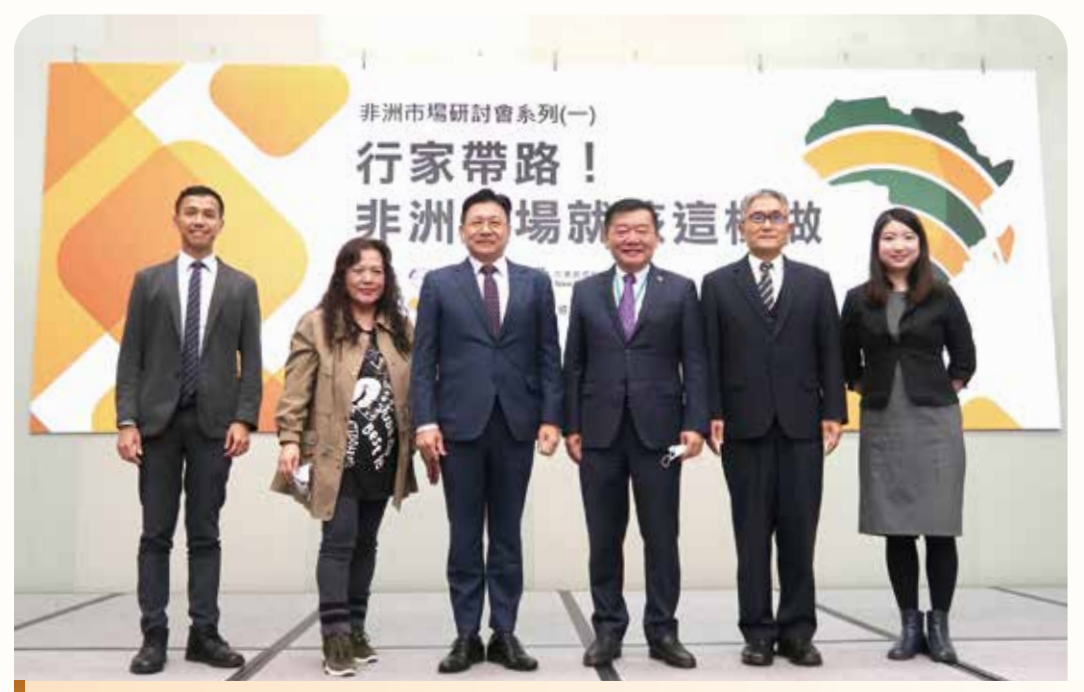
Eximbank participated in the seminar "Follow the Experts! This Is How It Is Done in the African Market" organized by the Taiwan External Trade Development Council and the Bureau of Foreign Trade, Ministry of Economic Affairs, to advocate how to access funding with the government's financing resources and hedge risks with export insurance. (Photo taken in March 2021)