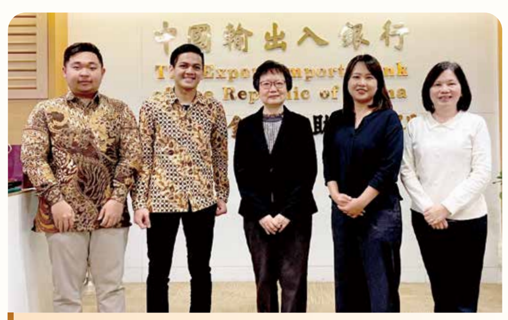
Eximbank signed a Relending Facility Agreement with PT Bank Negara Indonesia (Persero) Tbk to assist companies in Taiwan and Indonesia and help Taiwanese companies in business development in Indonesia. (Photo taken in March 2021)

The fair value of a financial instrument without an active market or if the quote is unavailable is determined using valuation techniques. In this case, the fair value is estimated based on observable data or models of similar financial instruments. When there is no observable market parameter, the fair value of the financial instrument is estimated based on appropriate assumptions. When determining the fair value using valuation models, all models shall be adjusted to ensure that the results reflect the actual data and market price.