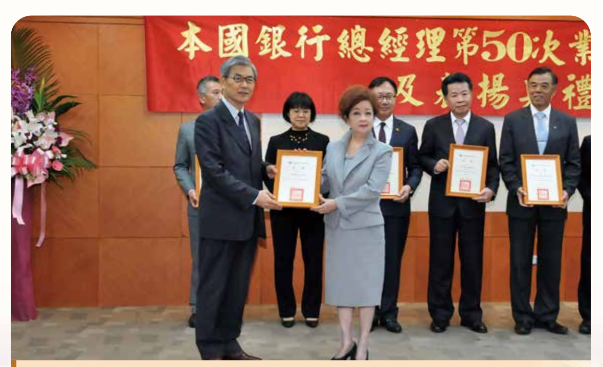
For praising Eximbank's contribution in the promotion of finance knowledge at campuses, the Financial Supervisory Commission issued a special award "Promotion of Finance Knowledge at Schools and in Communities" to recognize Eximbank's dedicated efforts in the development of finance talents in Taiwan. (Photo taken in June 2020)

As the only state-owned specialized financial institution in Taiwan, Eximbank has shouldered with the policy-oriented mission to assist enterprises in expanding the overseas markets. Besides promoting the government's major policies continuously, Eximbank has not only offered complete trade and financial services strongly supporting domestic enterprises in the expansion of foreign markets, but